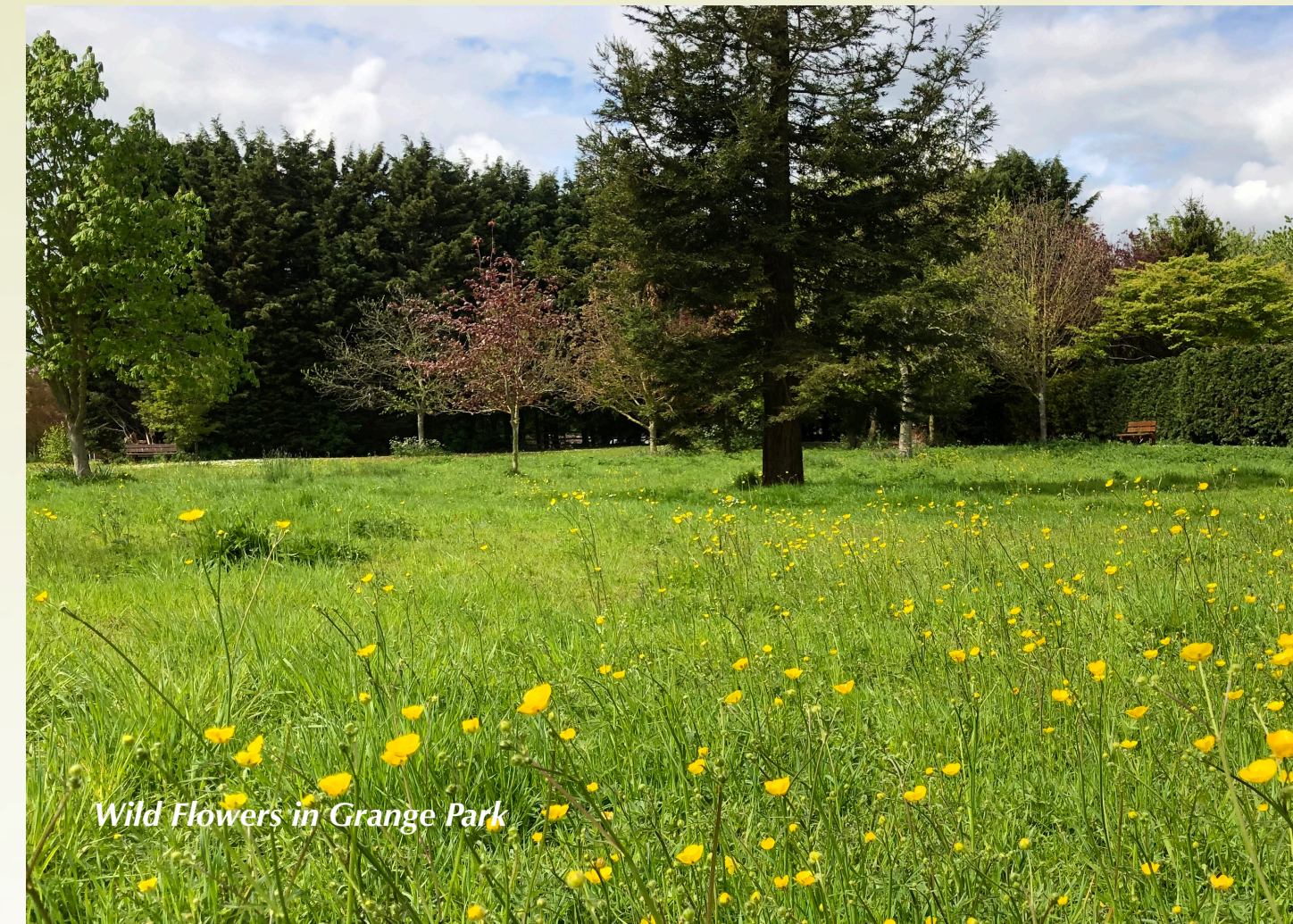
Wild Flowers in Grange Park