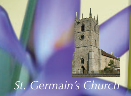
St. Germain's Church

For full details of the Memorial, Commemorative and Notable trees please see reverse of this noticeboard.