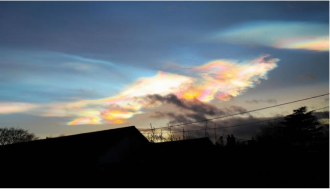
Beautiful photographs of the recent rainbow clouds seen over Scothern (Alan Burgess)