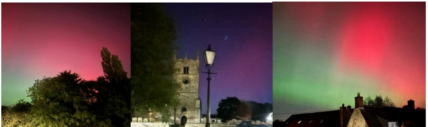
Some beautiful shots of the Northern Lights recently seen over Scothern.