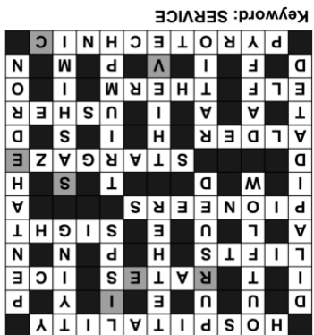
Quick crossword 2

If so, please do email scothernpm@btinternet.com . Suggestions, comments and letters are very welcome.